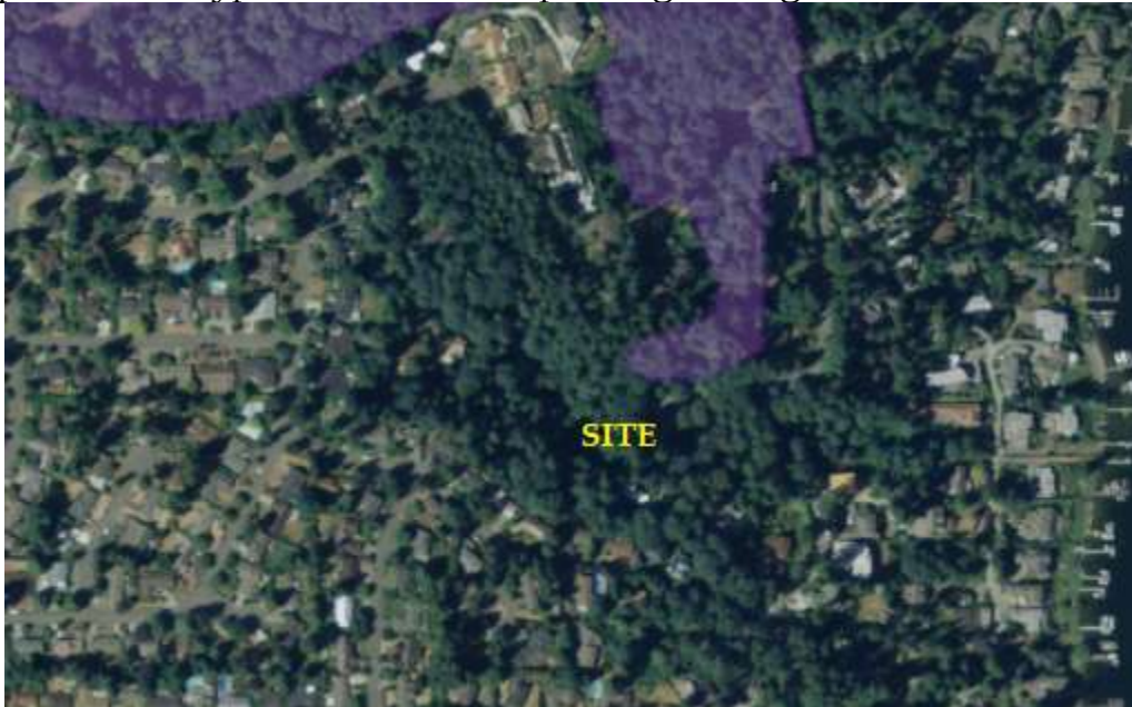
Above: WDFW Priority Habitat mapping of the area of the site.

Wetland A is a forested wetland and as such provides habitat to numerous species that tolerate being within close proximity to humans. The wetland main function is as a groundwater discharge point, which allows groundwater to reach the surface and provide hydrological support to the Type 2 watercourse passing through the site.